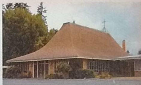
St. Olaf (1968) 18943 Caldart Ave. NE, Poulsbo, 98370