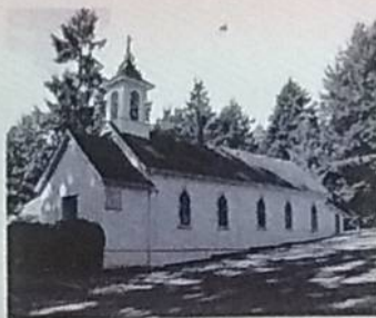
St. Peter (1863) 910 South Street, Suquamish