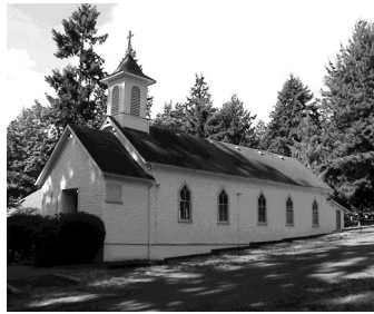
St. Peter (1863) 910 South Street, Suquamish