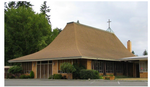
St. Olaf (1968) 18943 Caldara Ave. NE, Poulsbo, 98370