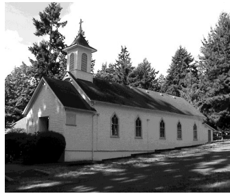
St. Peter (1863) 910 South Street, Suquamish