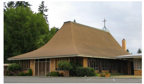
St. Olaf (1968) 18943 Caldara Ave. NE, Poulsbo, 98370