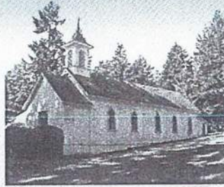
St. Peter (1863) 910 South Street, Suquamish