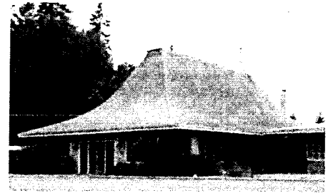
St. Olaf (1968) 18943 Caldart Ave. NE, Poulsbo, 98370