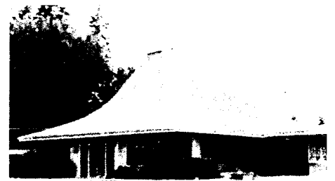
St. Olaf (1968) 18943 Caldart Ave. NE, Poulsbo, 98370