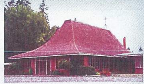
St. Olaf (1968) 18943 Caldart Ave. NE, Poulsbo, 98370