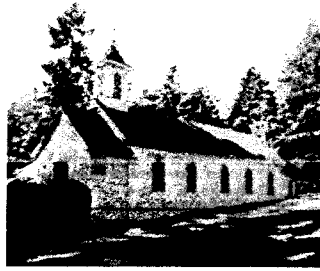
St. Peter (1863) 910 South Street, Suquamish