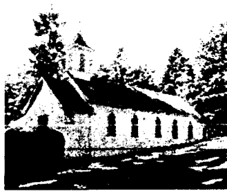
St. Peter (1863) 910 South Street, Suquamish